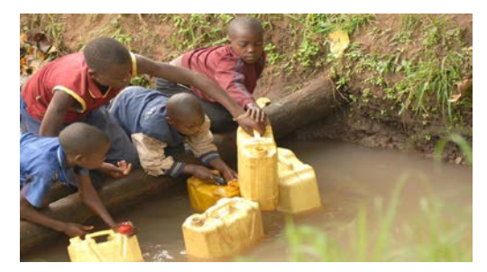
Fig. 1 Children collecting unsafe water for drinking.

The approach was to employ SF units that were exactly as constructed and used in households, but within a controlled laboratory setting. Accordingly plastic filters were constructed inside the process laboratory of the Wolkite University. Filters were of the 20 cm height and 10 cm internal diameters. Considering the time and cost constraint, plastic is selected as the construction material for all filter parts. 4 L plastic bottle was selected to be the suitable